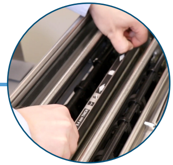
Quick Change Creasing Matrix Easy to swap in just seconds, with no tools required