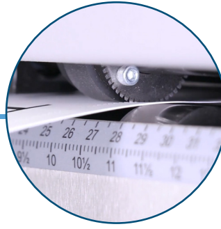
Optional Second Crease/Perforation Kit Allows for single-pass up/down creasing/perforation