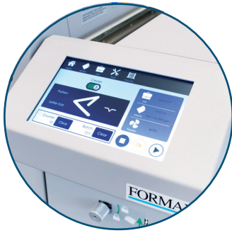
Intuitive Color Touchscreen User-friendly interface with bold icons makes setup quick and easy

The ATLAS C150 High-Speed Automatic Creaser/Perforator is user-friendly solution to the problem of cracking in toner-based digital prints. It features a heavy-duty, lifetime guaranteed creasing matrix for accurate high-speed creasing and folding in a single pass. Using the intuitive touchscreen control panel , it automatically sets the crease locations, and users can easily store unlimited custom jobs . The top-loading vacuum infeed adjusts automatically to handle media stacks up to 7.8" high and weights from 75-400gsm. With its extra-long infeed table , it can handle sheets up to 51" long. An optional second creasing/perforating blade kit allows for single-pass up/down creasing and cross/partial perforation for hinges, book covers, and more. The rugged metal construction and compact footprint make it ideal for print facilities with limited space.