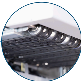
Top Vacuum Feed Controls sheet separation by constantly monitoring and making adjustments