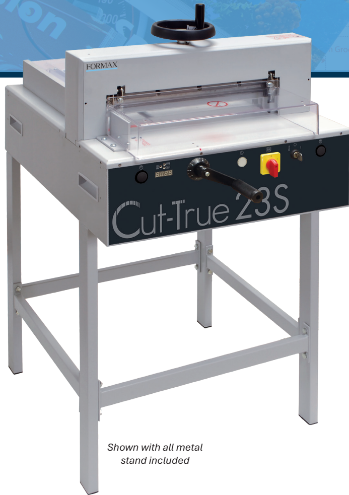
Shown with all metal stand included