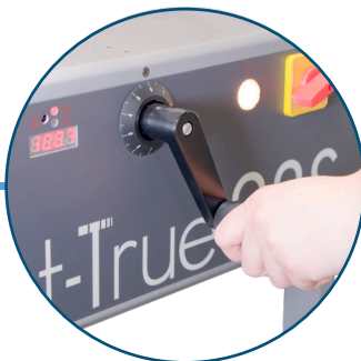
Manual Back Gauge Adjustment Fine-tune control for precision cutting