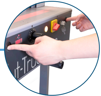
Two-Hand Operation Safely engages clamp and blade, keeping hands away from the cutting area