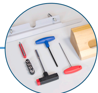
Blade Change Safety Tool Kit Change blades safely and easily, and make adjustments