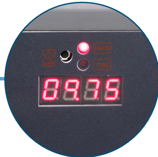
LED Back Gauge Display Get a precise cut using standard or metric settings