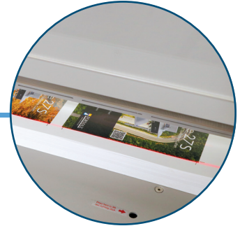
LED Laser Cut Line Shows where the blade will cut to make fine adjustments