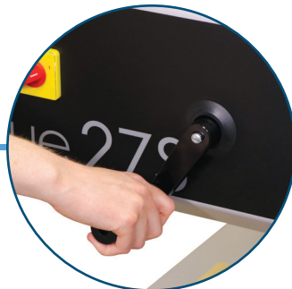
Spindle Guided Back Gauge Allows for fine adjustments in both inches and metric with LED display