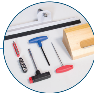
Blade Change Safety Tool Kit Change blade safely and easily, and make adjustments