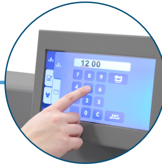
Touchscreen Control Panel Set cutting lengths, program and save up to 99 jobs, up to 30 cuts each