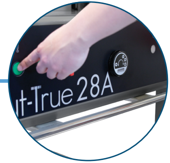
Two-Hand Operation Automatically engages clamp and blade, keeping hands away from the cutting area