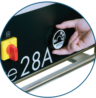
Electronic Back Gauge Adjustment Fine-tune control for precision cutting