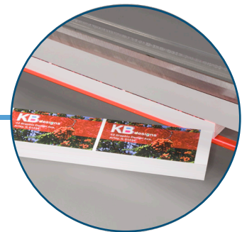
Crisp, accurate cuts High-quality hardened steel blade for razor sharp cuts, time after time