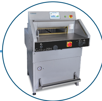
Standard Model Compact model without optional side tables