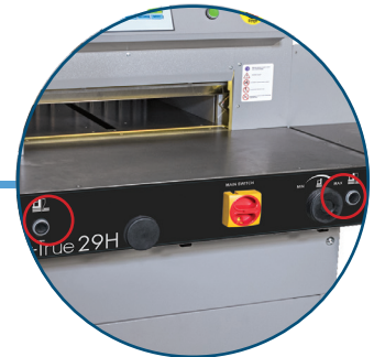
Two-Hand Operation Automatically engages clamp and blade keeping hands away from the cutting blade