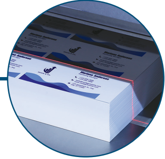
LED Laser Cut Line See where the blade will cut while making fine adjustments