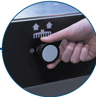
Electronic Back Gauge Switch Allows operators to precisely adjust the back gauge position