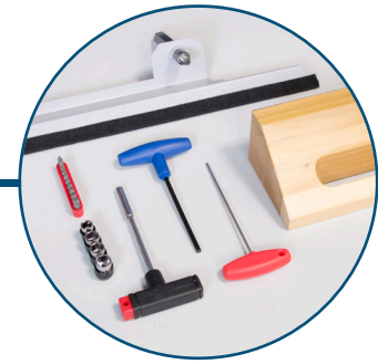
Blade Change Safety Tool Kit Change blades safely and easily, and make adjustments