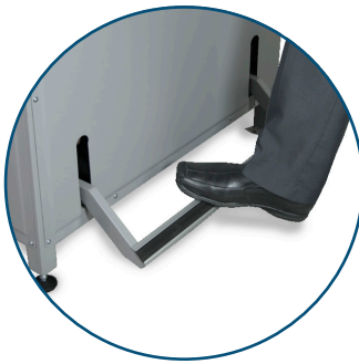
Foot Pedal Pre-Clamp Holds paper in place to check alignment prior to cutting