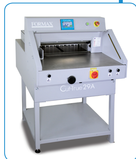
Standard model, without optional wide side tables

Formax – New Hampshire, USA www.formax.com