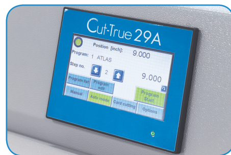
Full-color touchscreen control panel allows for programming up to 100 jobs