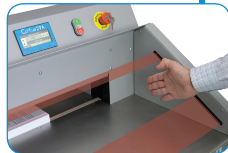
Infrared Safety Curtain shuts down operation if the beam is interrupted