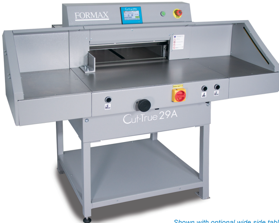
Shown with optional wide side tables

The Formax Cut-True 29A Electric Guillotine Paper Cutter offers precision cutting for paper stacks up to 20.5" wide. User-friendly, intuitive features include a touchscreen control panel, automatically-adjusting back gauge and the capacity to program up to 100 jobs/100 cuts . An infrared light beam safety curtain provides safety and convenience as it shuts down operation if the light plane is interrupted.