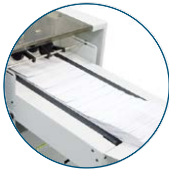
24" Outfeed Conveyor Integrated conveyor is collapsible for convenient storage