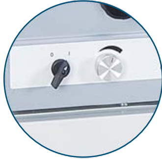
User-Friendly Controls On/Off switch and simple speed control knob

The AutoSeal® FD 2096 uses patented pressure seal technology to efficiently process cut-sheet forms at speeds of up to 30,000 forms per hour . Its bottom-suction air-feed system provides accurate feeding and allows for continual loading of forms, dramatically reducing down time. Set-up is quick and easy with rugged metal fold pates , clearly marked with standard and metric markings. The sealing unit utilizes an adjustable 17" 8-ball transport deck for a smooth, transition from the fold rollers into the sealer. Features include user-friendly operator controls , sound-dampening fold plate covers for quieter operation, rugged locking casters , and a high-capacity 24" output conveyor which is collapsible for convenient storage.