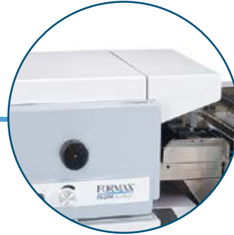
Sound-Reducing Insulation Fold plates are covered and insulated to reduce noise