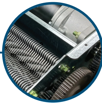
Commercial Grade Heat-treated solid steel cutting blades, all metal gears, & an AC geared motor