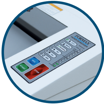
User-friendly Control Panel Auto Start/Stop/Reverse, Full Bin Indicator, Load Indicator

The FD 8400HS-1 High Security Office Shredder offers P-7 security with commercial-grade components in a sleek office design. Evaluated by the NSA to meet the requirements of NSA/CSS specification 02-01 for P-7 high security cross-cut shredders, its continuous-duty motor shreds up to 23 feet per minute , with a shred size of 1/32" x 3/16" . Commercial-grade features include heat-treated steel blades , a steel cabinet on casters , lifetime guaranteed waste bin , energy-saving ECO mode , and a user-friendly LED control panel . The standard EvenFlow™ Automatic Internal Oiling System helps to keep the FD 8400HS-1 in peak operating condition.