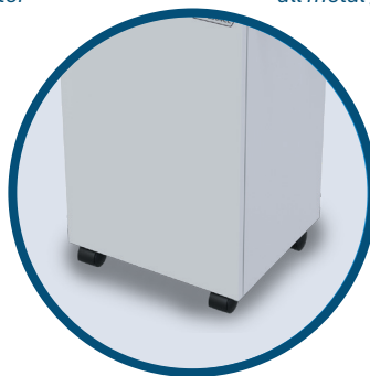
Rugged All-Metal Cabinet Includes casters for mobility