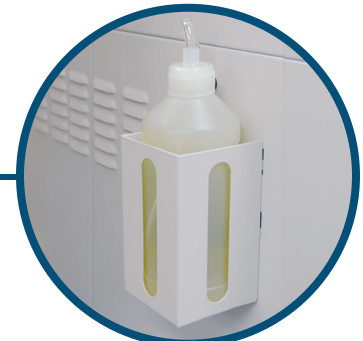
Automatic Oiling System EvenFlow™ Automatic Oiling System lubricates blades for peak performance