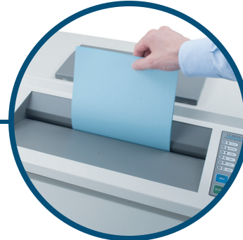
Standard Infeed Hand-feeding slot accommodates up to 24 sheets