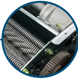
Commercial Grade Heat-treated solid steel cutting blades, all metal gears, AC geared motor