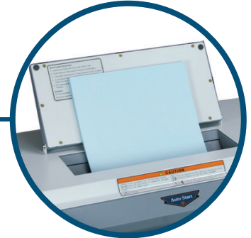
AutoFeed Hopper Infeed Holds up to 175 sheets for convenient, unattended shredding