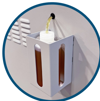
Automatic Oiling System EvenFlow™ Automatic Oiling System lubricates blades for peak performance