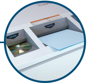
Dedicated Systems Separate infeeds and waste bins for paper and optical media