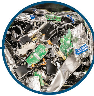
Commercial Grade SSDs and HDDs are no match for the solid-steel blades and rugged chain-driven motor