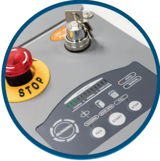
User-Friendly Control Panel Door Open Sensor, Reverse, Waste Bin Full Indicator

The Formax FD 87HDS HDD / SSD Hard Drive Shredder provides the best level of security by physically destroying discarded hard drives. Separate shredding chambers sized for 3.5" HDD and 2.5" SSD & HDD drives have sliding metal shields for safety and are designed for continuous operation . Its chain-driven AC-gear motor is housed in a solid-metal cabinet with casters for mobility and is engineered for low operational noise. Combining safety, durability, and an extra level of security, FD 87HDS is the best choice to protect your digital data.