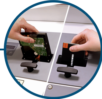
Separate Shredding Chambers Metal safety shields for safe, continuous operation, and individual LED counters