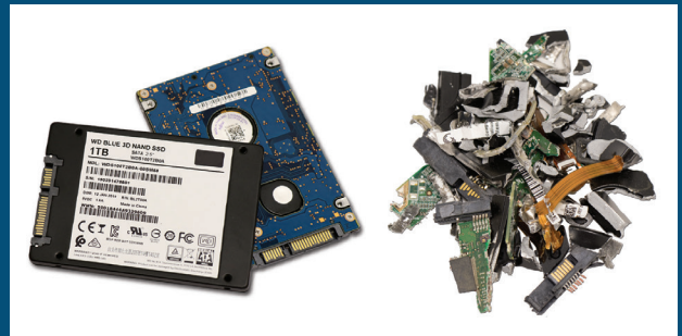
2.5" HDD & SSD Hard Drives