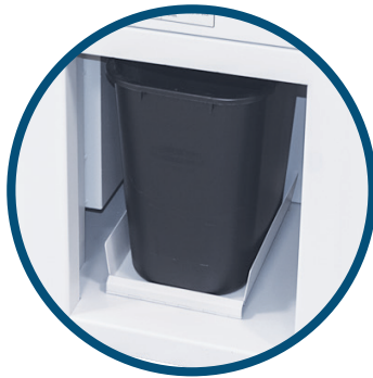
Rugged Waste Bin Durable molded plastic for convenient collection of shredded particles