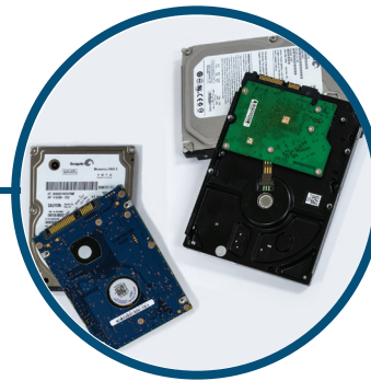
Shreds Multiple Size Drives Designed for shredding 3.5" desktop HDDs, and 2.5" laptop HDDs and SSDs