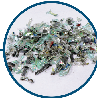
Media Shredding: Shreds media into random pieces up to 0.60". Perfect for security and peace of mind