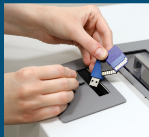
USBs and SD Cards