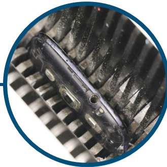
Commercial Grade: Solid-steel heat-treated blades and rugged chain-driven motor