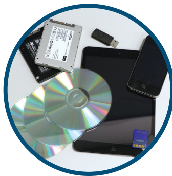
Multimedia Devices: Easily shreds a variety of media from mobile phones to mini tablets