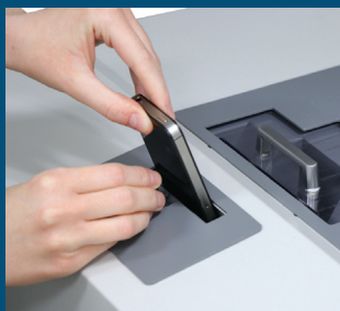
Mobile Phones and SSDs