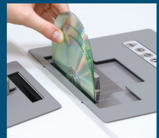
CDs and DVDs