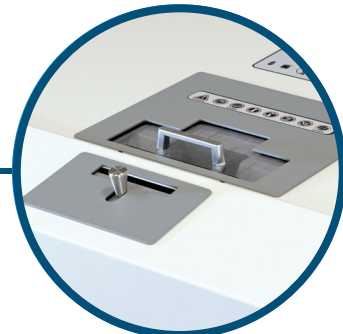
3 Dedicated Infeed Options: Safely feed various size media through the appropriate infeed, up to 6.5" W