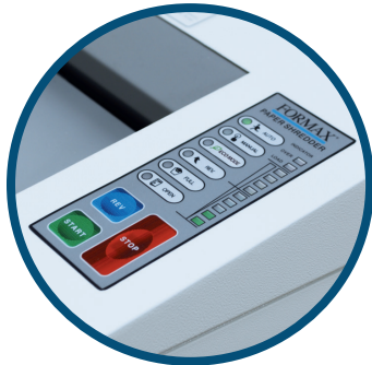
Easy-to-Use Control Panel Auto, Reverse, Bin Full Indicator, Load Indicator, ECO Mode

The Formax FD 87SSD OnSite Multimedia Office Shredder is designed for the modern technological world. It easily shreds mobile phones, SSDs, mini tablets, USBs, and more . The FD 87SSD is whisper-quiet and operates on standard 120V power , making it ideal for the office environment. It features a user-friendly LED control panel , a sturdy all-metal cabinet , solid steel cutting blades , and a rugged chain-driven motor . The separate enclosed infeed options allow users to safely shred a variety of media up to 6.5" wide. With its commercial-grade construction, the FD 87SSD sets the standard for safety and security.