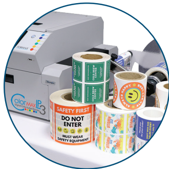
Compatible Across Substrates Works easily with paper, polyester, polypropylene and vinyl label stocks