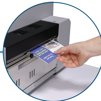
Two Operating Modes Continuous roll-to-roll for production, integrated cutter for short-run jobs