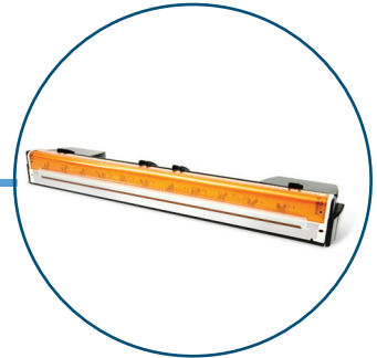
Memjet® Inkjet Print Head Stationary print head with no moving parts features 70,400 inkjet nozzles